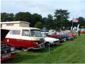
Punch lad ( and Lass ).